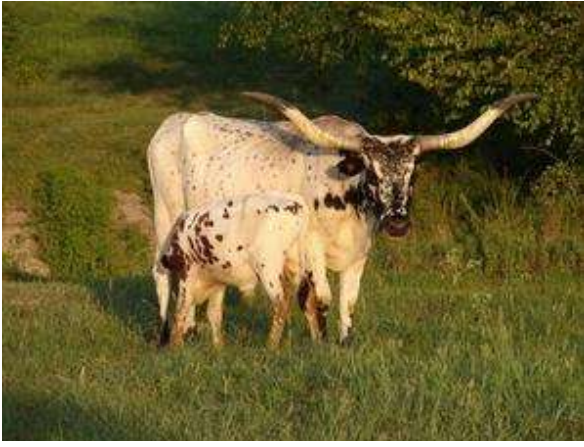
77. Texas Longhorn