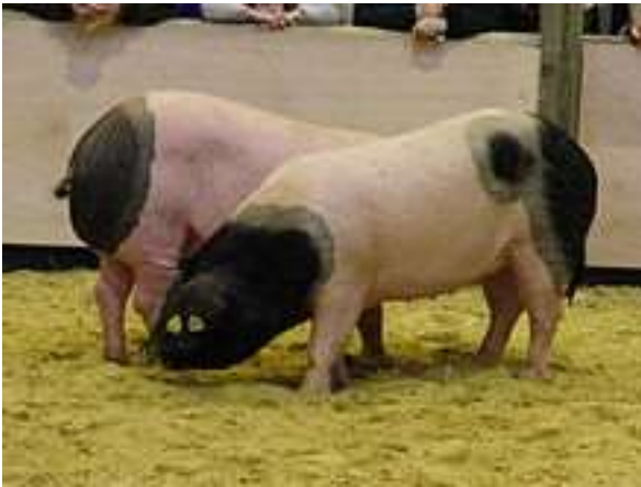
78. Basque Pig