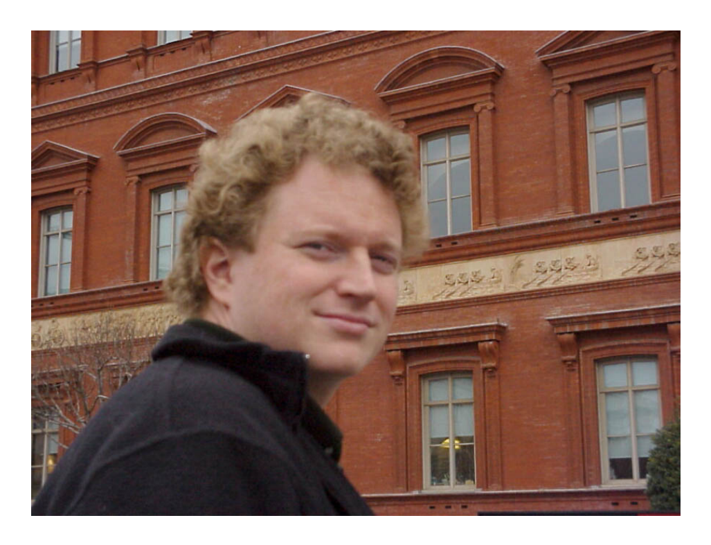
Around the National Building Museum