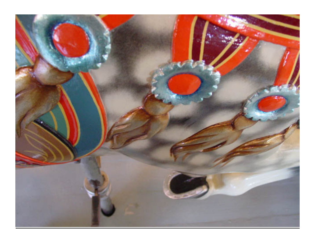
The family-favorite carousel on the Mall is in front of the old Smithsonian building

Brute Force: "Buffy is cooler than you."