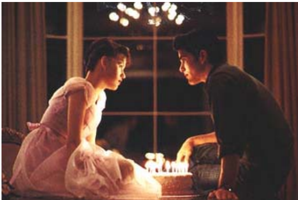
17. How old is this lovely young lady?