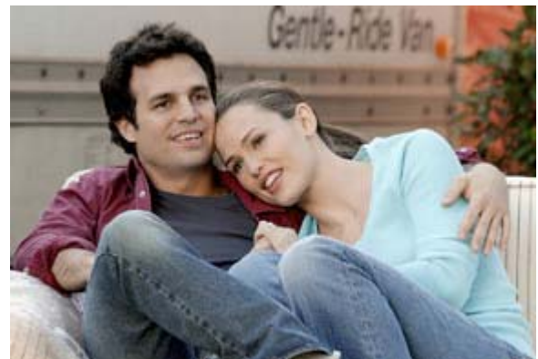
16. What snack do this couple bond over?