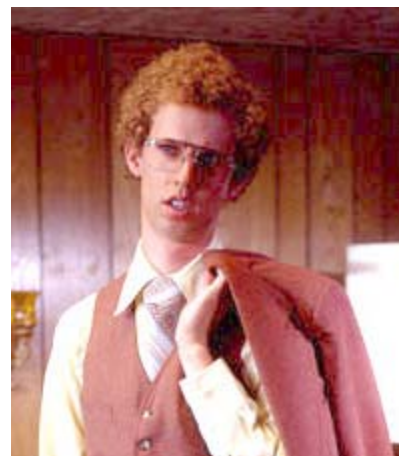
18. What did he do last summer, and where?