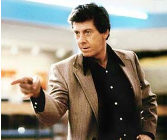
13. "I heard a _____!"