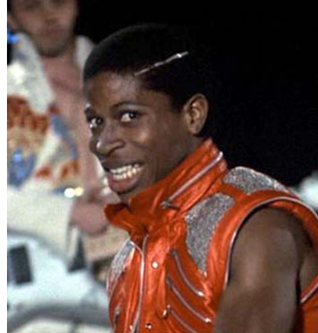
14. How is his javelin-throwing style characterized?