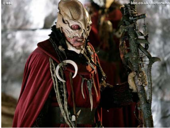
28. a. Sycorax