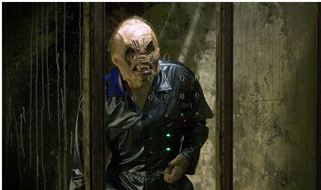
30. a. Weevil