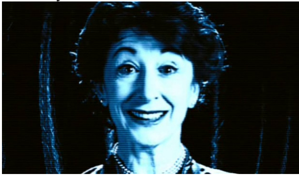
29. a. The Wire