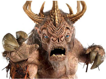
14. a. Minotaur