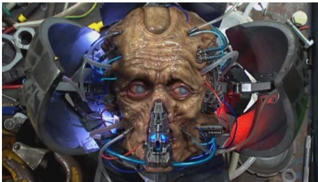
31. a. Toclafane