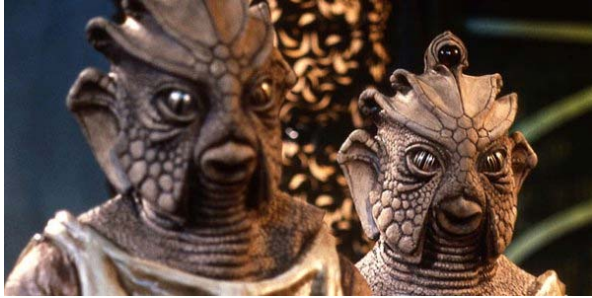
13. a. Silurians