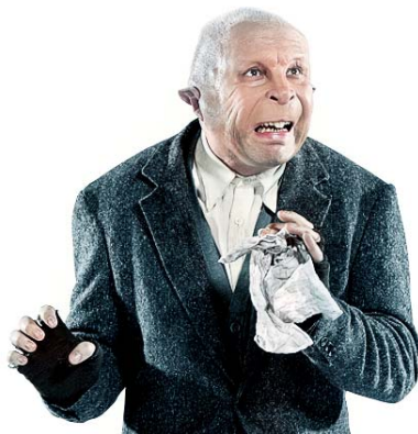
16. a. Tivoli